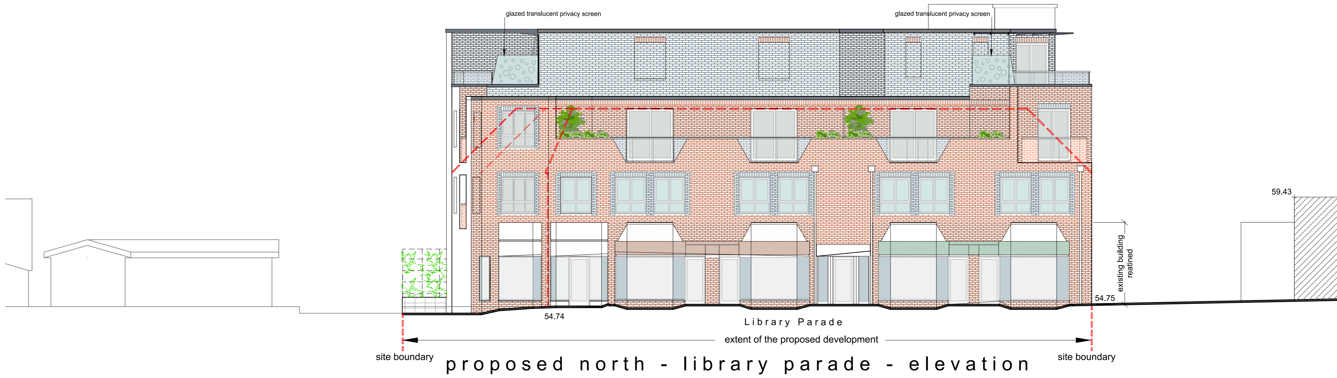
proposed north - library parade - elevation